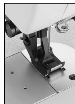
Extra wide zig-zag (10mm)

* Depends on thread, material, type of operation and width of zig-zag